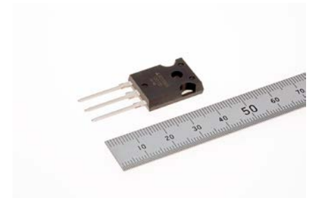
1200V SiC-SBD TO-247 package

TOKYO, March 27, 2019 – Mitsubishi Electric Corporation (TOKYO: 6503) announced regarding the launch of a new 1200V silicon-carbide Schottky-barrier diode (SiC-SBD) that reduces the power loss and physical size of applications such as power supply systems for infrastructure, photovoltaic power systems and more. Sample shipments will start in June 2019 and sales will begin in January 2020.